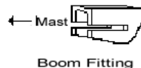
Fig. no. 3