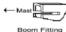
Fig. no. 3